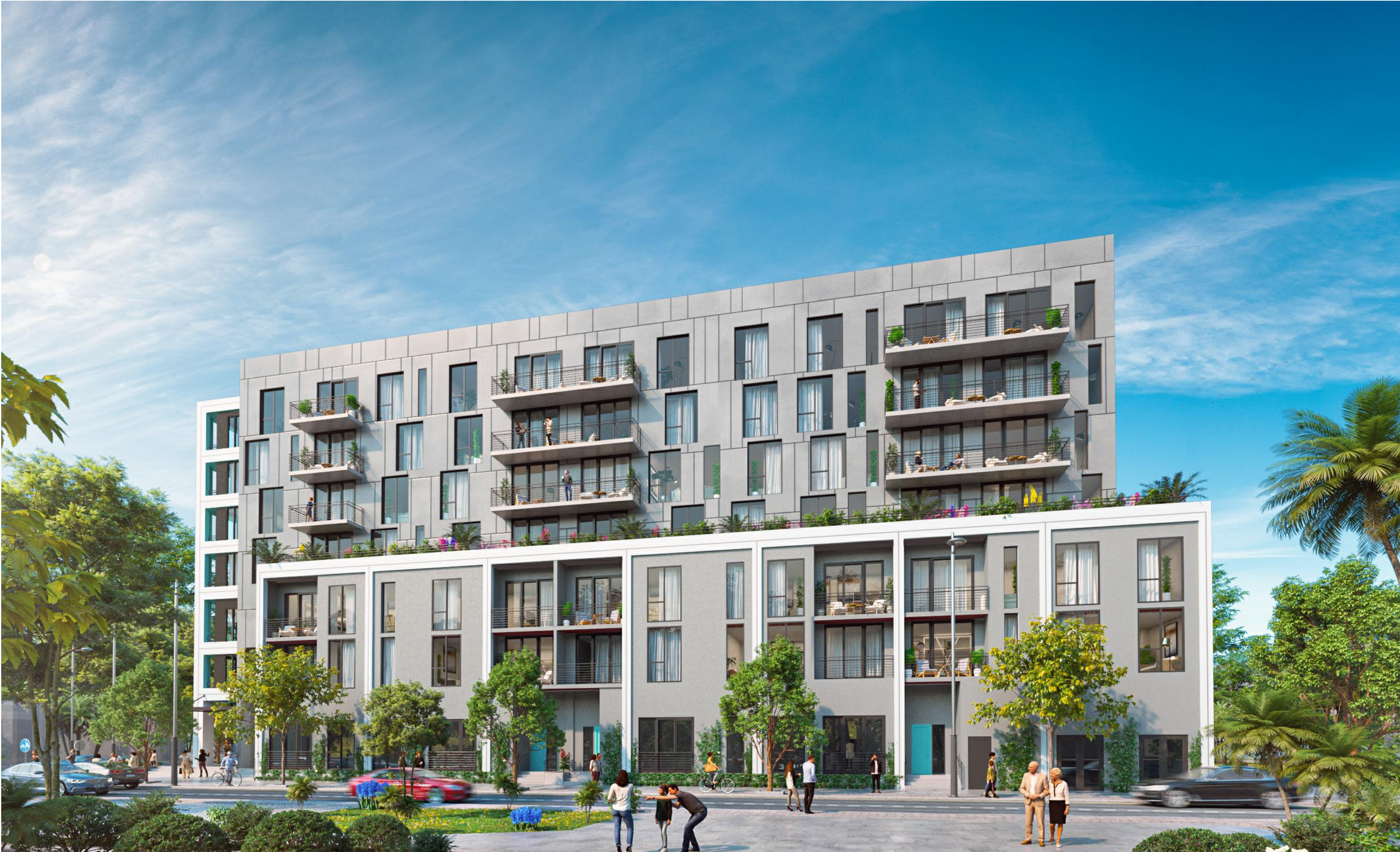
3D RENDERING -EAST VIEW (FRONTING NE 22ND AV.)